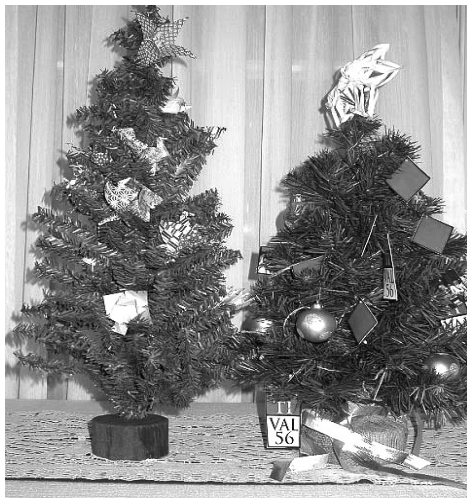
The 2011 Mini Christmas Tree Festival takes place Nov. 4 - Dec. 3. Don't miss this holiday event!

On December 3 from 1-4 p.m. there will be the Mini Christmas Tree Festival and a handmade Christmas Gift Boutique in the gallery. A Christmas Carol Sing-Along will be held at 2 p.m. in the theater followed by hot chocolate and cookies in the gallery. The last chance to enter a bid in the silent auction for a beautiful Mini Christmas Tree will be at 4 p.m. The lucky winners will have a lovely addition to their holiday decorations. Please join us for lots of fun and enjoy the Christmas spirit!