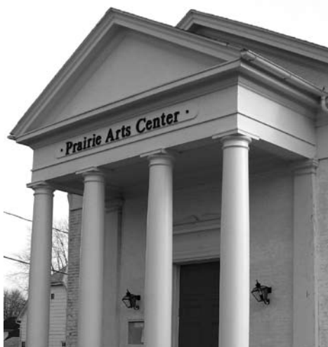
1996-2011 - Fifteen Years of the Prairie Arts Center will be celebrated on July 16

The open house will take place in the Prairie Arts Center Gallery and Fireplace Room.