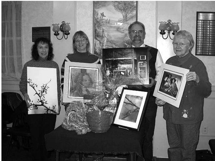
Some of the Prairie Arts Council Board Members pose with just a sampling of items that will be up for Auction at the 16th Annual Gala that will be held Friday, Feb. 4, 2011 at 7:00 p.m. at the Wine Cellar on Main Street in Princeton IL.

The theme for this year's PAC gala will be "Building Our Future in the Arts", and this theme will be reflected in the many both silent and live auction items as we work together to build and strengthen our future in the arts and those of our children and grandchildren.