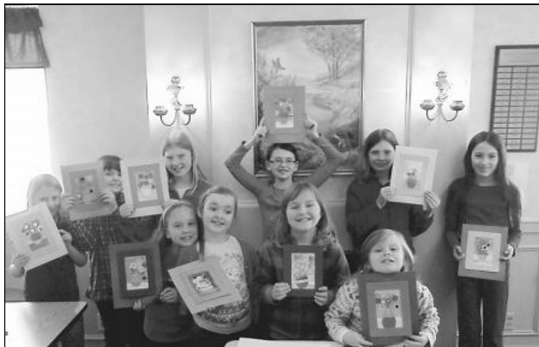
Participants in a previous children's art class at the Prairie Arts Center show their Van Gogh creations.